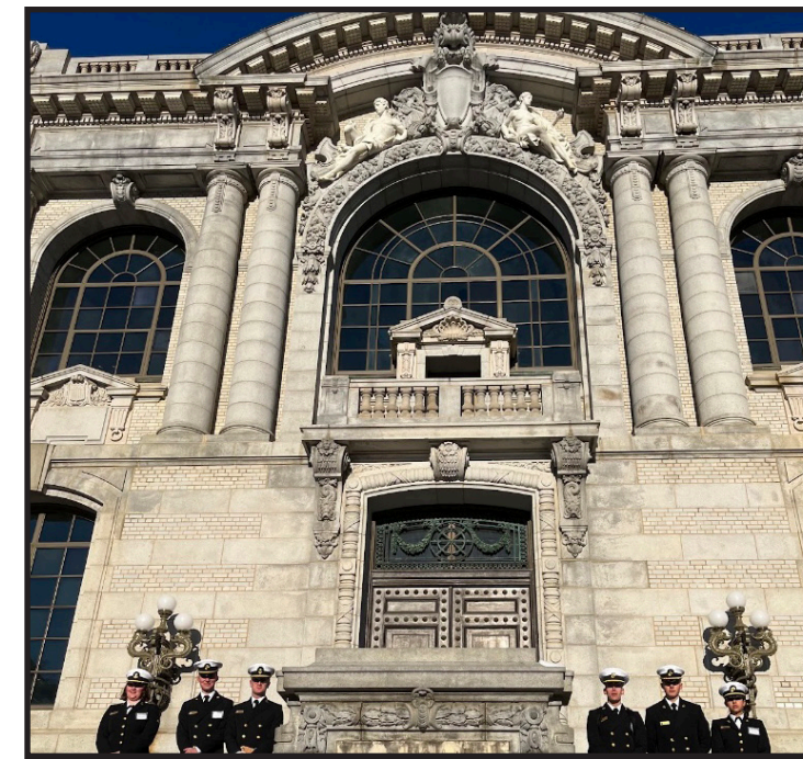
Capital Battalion midshipmen arrive at the United States Naval Academy.

Each midshipmen attendee left the conference with new perspectives on leadership techniques which they hope to bring back to the Capital Battalion and eventually the fleet. The unit looks forward to joining the next Leadership Conference in 2025.